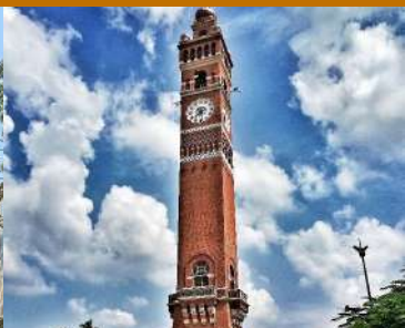
Husainabad Clock Tower