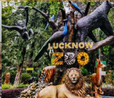
Nawab Wajid Ali Shah Zoological Garden